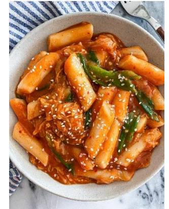
Korean Rice Cake (giant noodle) Tteok-bokki

We hope you are enjoying the warmer months and getting outside! Remember to stay hydrated with lots of water and unsweetened beverages!