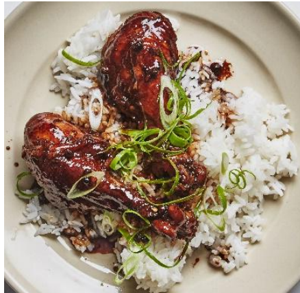
Philippines Adobo Chicken