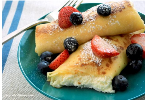
Jewish American Blintzes with berries