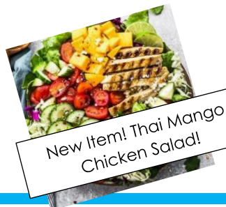
New Item! Thai Mango Chicken Salad!

* All scholars receive 1 breakfast and 1 lunch free of charge. *Finn Academy is an equal opportunity employer.