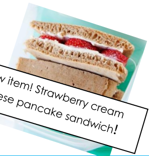
New item! Strawberry cream cheese pancake sandwich!

Find summer meal sites near you by calling the 2-1-1 HELPLINE at 1-800-346-2211, VISIT www.211helpline.org , TEXT FOOD or COMIDA to 877-877 (text rates apply) or contact the district foodservice office at 607-737-8040